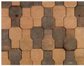
Cumberland Blend, Running Bond Pattern