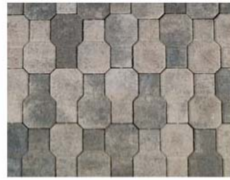
Pewter Blend, Running Bond Pattern