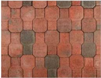
Red River Blend, Running Bond Pattern